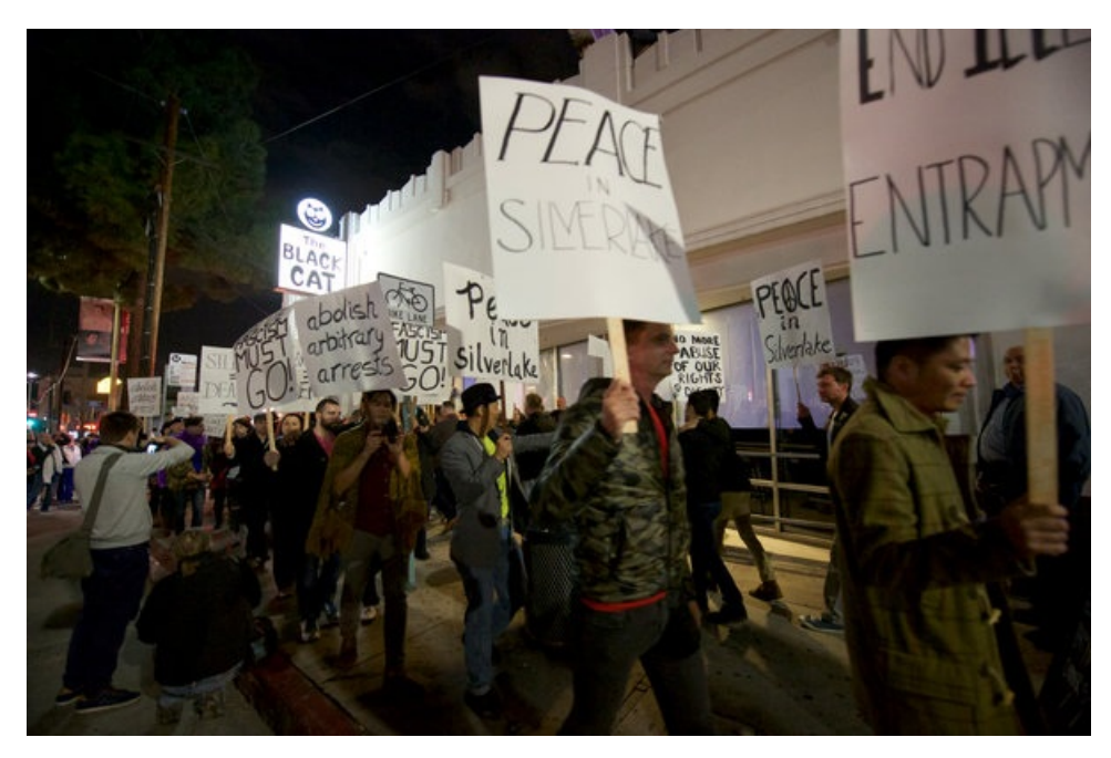
SILVER LAKE - Gay activists marked the 50th anniversary of the demonstration at The Black Cat, the site of the first LGBTQ civil rights protest in the United States, with a re-enactment, celebration, march and a modern-day rally.